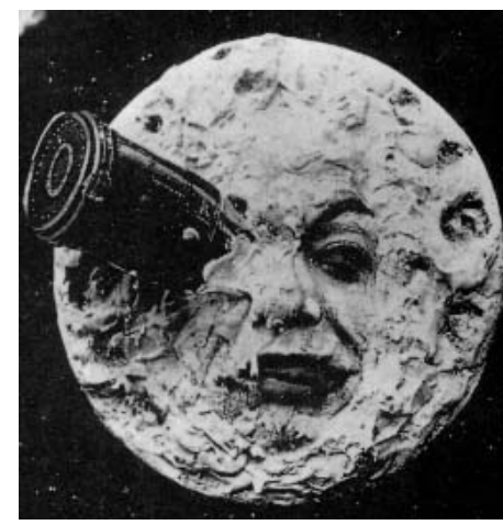
"A Trip to the Moon" directed by Georges Méliès